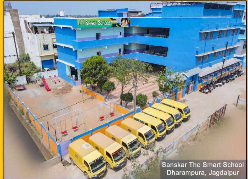
Sanskar The Smart School Dharampura, Jagdalpur