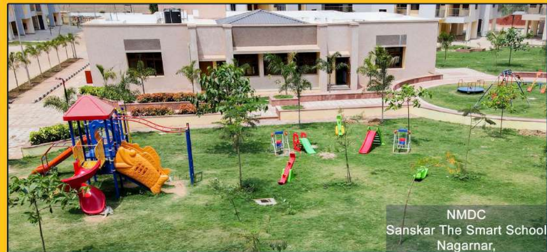
NMDC Sanskar The Smart School Nagarnar,